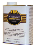
X-Tender Slows drying time of fast dry oil and solvent based paints