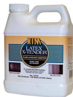
Latex X Tender Open Time Flow & Leveling Additive