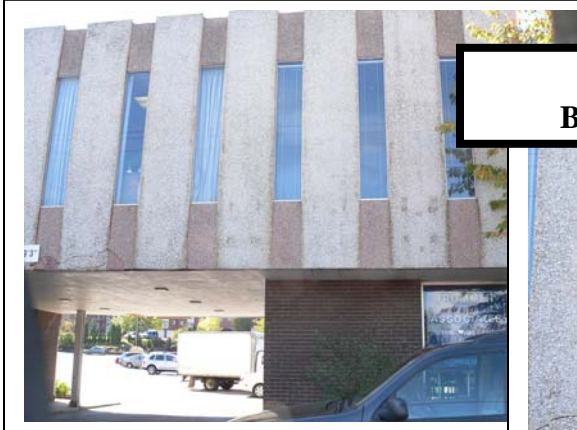
Stone Surface Before Refinishing

Office Building, Fairlawn, OH (Akron Area) - 2005